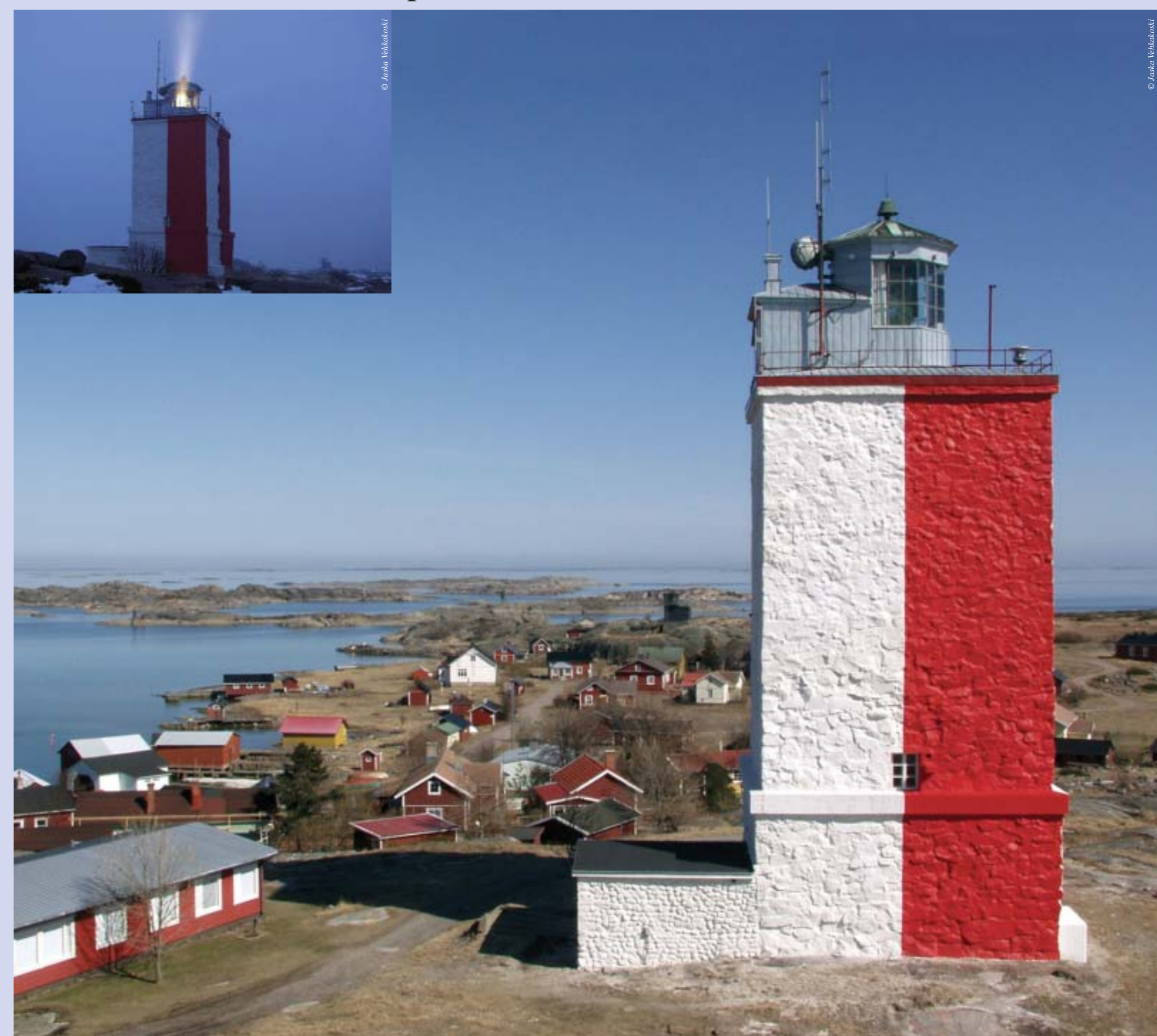
Utö lighthouse is the oldest lighthouse in Finland and located in the archipelago village Utö.

Lighthouse tourism project promotes tourism on lighthouses in southwest Finland and in Estonia. The project is coordinated by the Centre for Extension Studies of the University of Turku. The project takes place 1.4.-31.12.2007 and is a part of Interreg IIIA programme financed by the EU, Ministries of Interior in Finland and in Estonia, several towns and municipalities, enterprises and organisations and associations related to lighthouses.