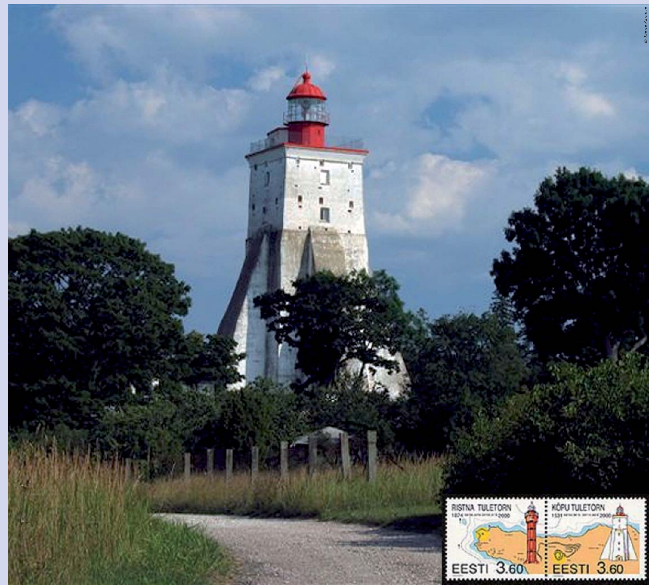
Kõpu lighthouse in Hiiumaa is the 3 rd oldest in the world and also drawn on Estonian stamps.